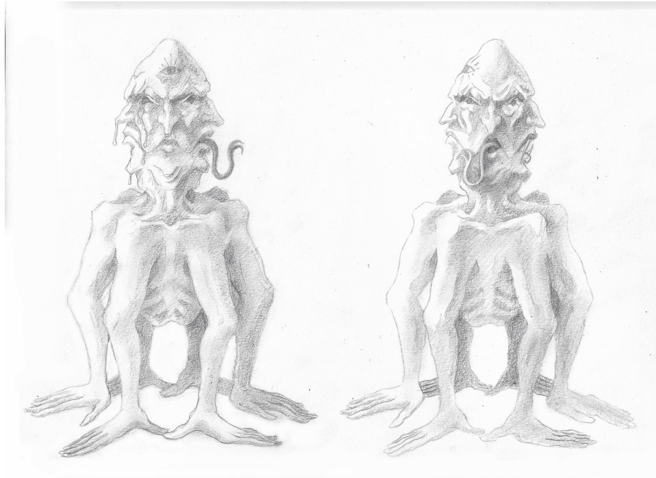
Figure 3A. Multipler Personality Disorder. Two research subjects independently described this psychic apparition.