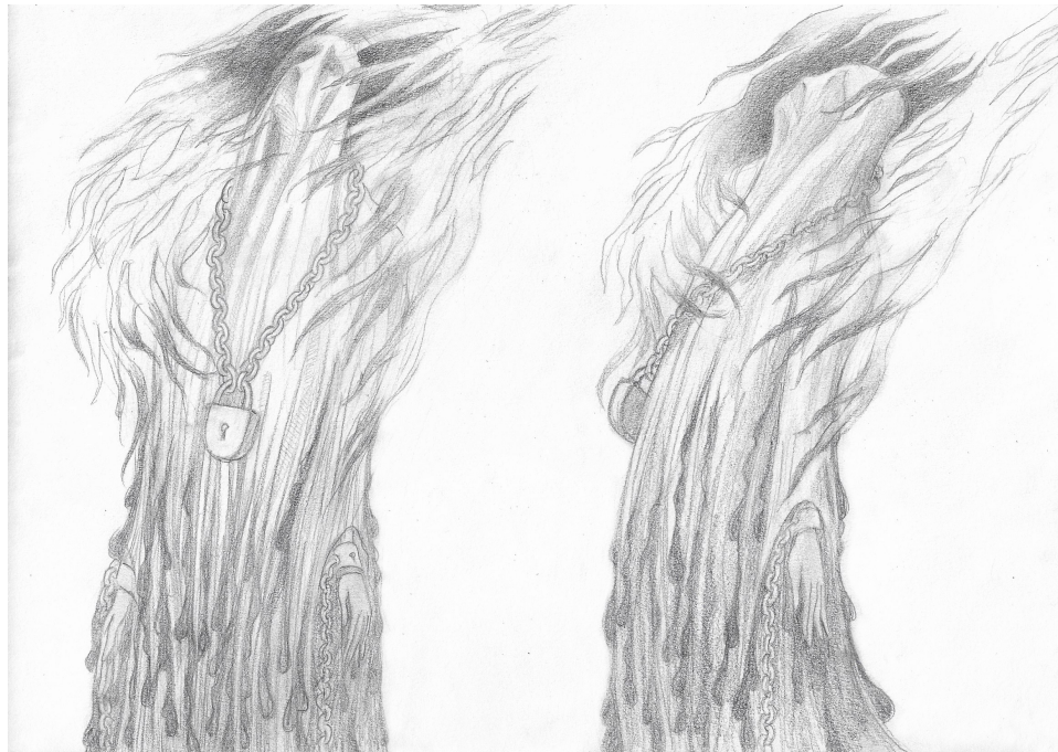
Figure 2A. Depression. Four total subjects independently described this entity.

Anorexia Nervosa , without ever knowing each other, and to their recollection, without ever having come into contact with one another, or ever having seen this creature in popular culture nor other possible memory contaminations such-as. Furthermore, upon aggregating my drawings of the 240 subjects of all three trials, there were another four psychic creatures of equally odd character to the first that were qualitatively identical in their descriptions by the subjects and statistically significant ( p=0.08 ) enough to be more than random chance occurrence. Figure 2A is a qualitatively identical apparition described by four subjects of the 240 total subjects. Figure 3A is a qualitatively identical apparition described by two subjects of the 240 total subjects. Figure 4A is a qualitatively identical apparition described by three subjects of the 240 total subjects, all three of whom were coincidentally in the third trial group for reasons dismissed as chance. In each case, the only commonality among research subjects who described the same qualitative features in the drawings hereafter, was a pre-developed, undiagnosed mental pathology. Each pathology is listed underneath the drawing next to the figure listing.